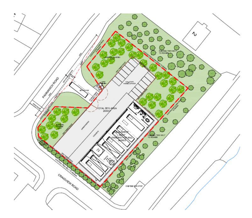
Figure 3: Site Layout (Extract from Drawing No 40032-L-002 Rev F – For information only).

6. The building is a functional one and has been designed to reflect its purpose. The walls and roof will be clad in Kingspan insulated cladding panels in vertical application, with the walls finished in bottle green and the roof